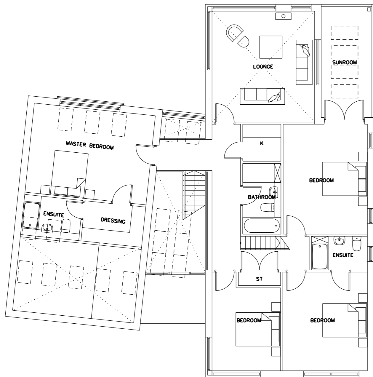
PROPOSED PLAN LEVEL 01

REVISION DATE AND DESCRIPTION A 24.01.16 WIDTH AND PITCH REDUCTIONS AS PLANNERS COMMENTS